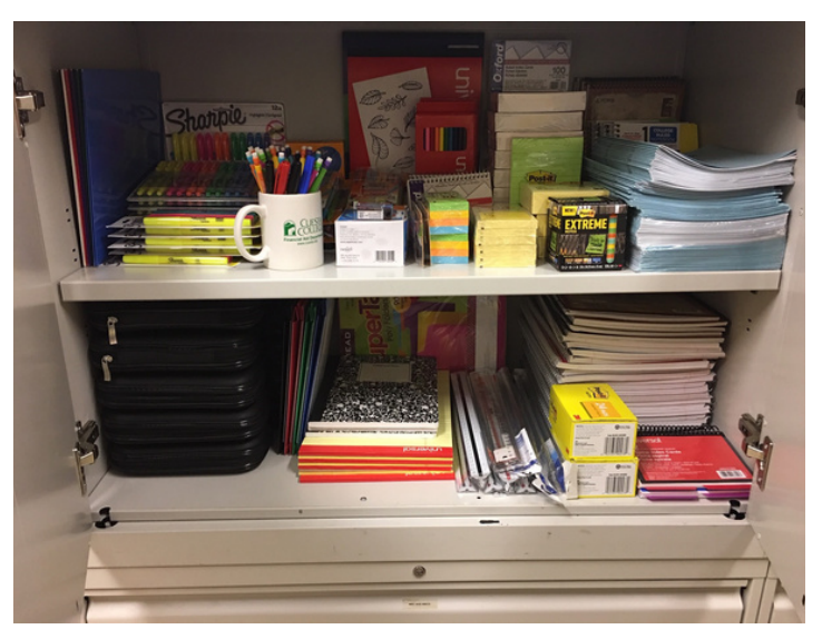
SCHOOL SUPPLIES

If you are in need of school supplies, please contact veterans@cuesta.edu